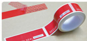
Could keep serial number