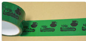
Custom company logo